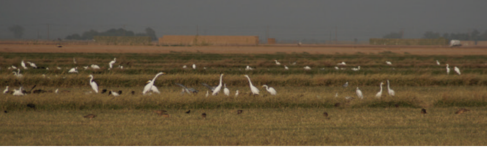
GREAT EGRETS and other birds foraging in the Imperial Valley south of the Salton Sea.

constructed, or freshwater flows could be diverted to the shoreline while allowing the central basins to increase in salinity. Proposals for pumping in fresh water or desalinated water from elsewhere—even possibly from the Gulf of California—are currently under consideration with the Salton Sea Management Program.