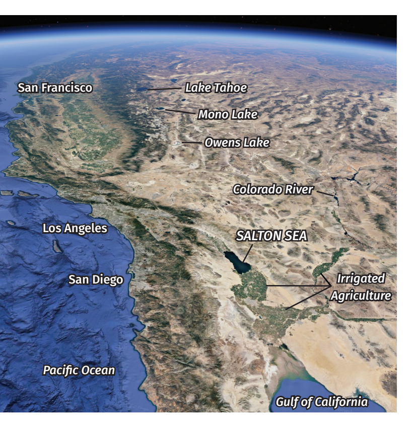
FIGURE 1.1 Viewing the Salton Sea in its western North America regional context reveals its critical position for water birds migrating lake-to-lake along the Pacific Flyway as well as the vastness of irrigated agricultural lands to the south.

THE SALTON SEA is shrinking primarily because regional water policy—indirectly—is providing it a significantly smaller share of water from the Colorado River (Box 1A). The Salton Sea's main water source has always been the Colorado River, which flows through some of the driest portions of the United States. Water released from upstream dams on the Colorado River in Colorado, Utah, and Arizona is earmarked for use by seven states and a myriad of water districts. California holds senior water rights on much of this water, most of which in turn is allocated to the Imperial Irrigation District, which supports the agricultural production of the Imperial Valley to the south of the Salton Sea. Much smaller portions of California's share go to other irrigation and municipal water districts in the region (Thrash and Hanlon, 2019). Colorado River water makes its way to the Salton Sea as irrigation run-off from the agricultural fields of the Imperial