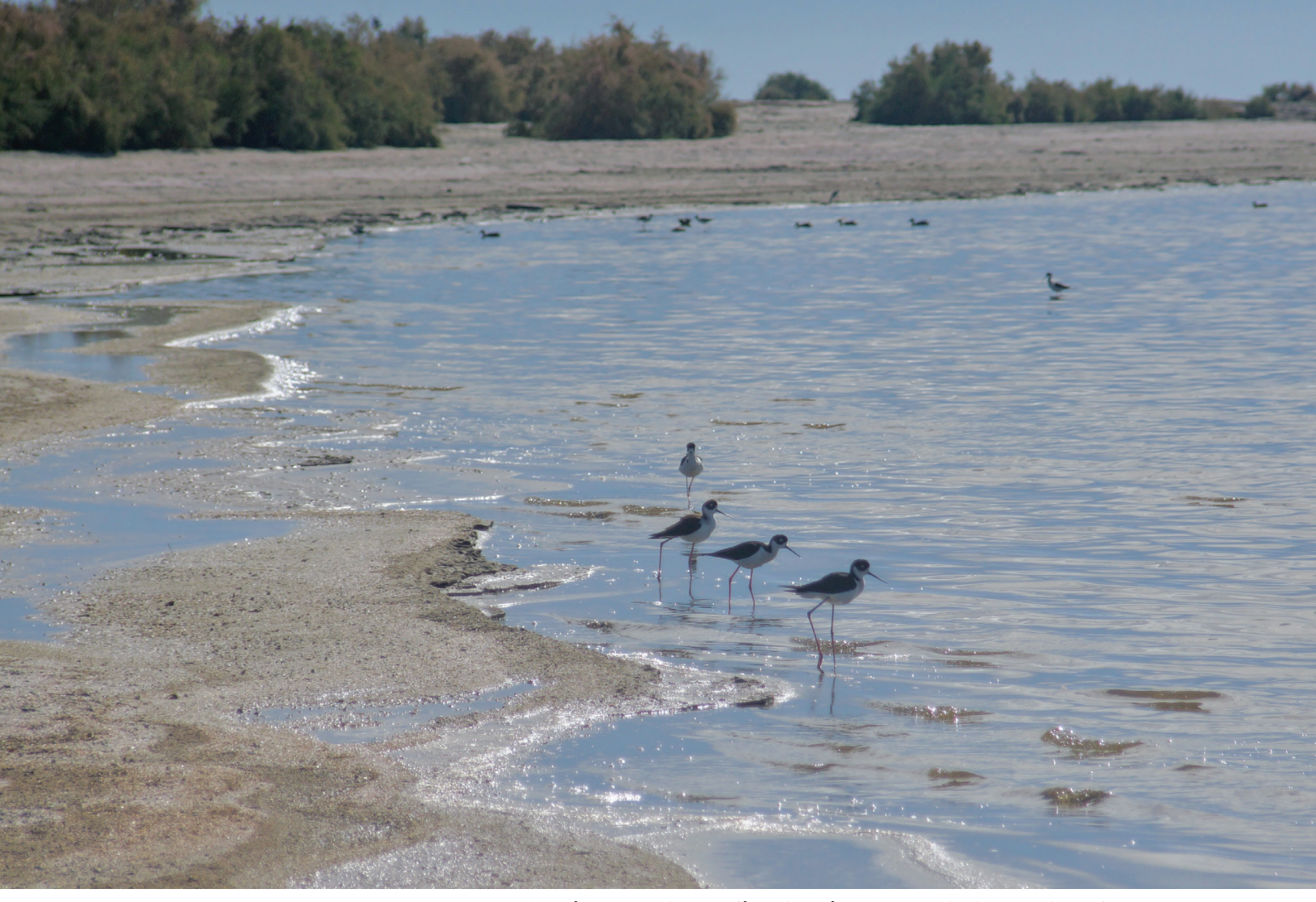
BLACK-NECKED STILTS foraging along the receding shoreline near North Shore Yacht Club. Jonathan Nye

concept. Indeed, more than two decades have transpired since the introduction of the water transfer between the Imperial Irrigation District and the San Diego County Water Authority that would become the 2003 Quantitative Settlement Agreement (Littleworth and Garner, 2019), yet little has been accomplished.